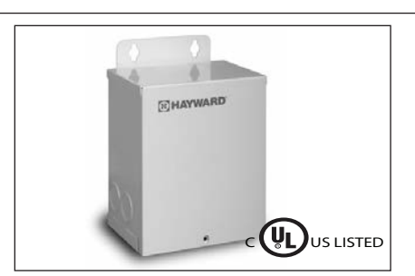
300 Watt Transformer