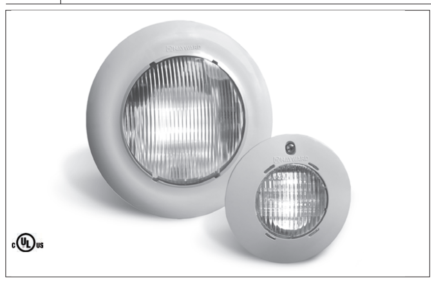
Universal CrystaLogic White LED Lights